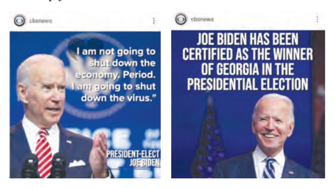
Pic. 6. CBS News. Joe Biden [6]

is omitted and that shows the personalized attitude to the 46<sup>th</sup> President of the USA, at the same time CBS addresses Joe Biden using his full name (pic. 6). Both memes (pic. 5) represent negative pieces of news the first one gives negative information directly to the politician, the second one shows personal attitude to the current Governor of New York - Andrew Cuomo, who has bad relations with Donald Trump. Such presentation of meme's contextual component creates negative sense of political suicide by Donald Trump - "but not to New York" demonstrates that personal arrogance is more valued by the politician than the wealth of nation (this informative meme differs from the one presented by Fox (Pic. 4)). Another aspect of this meme is graphics – all letters are capitalized that forms semiotic space and adds emotional marking. The phrase "Judge dismisses Trump campaign's latest attempt" uses semi-official style, but it has much in common with black humor and can be compared with the saying: "you can't make up for lost time".