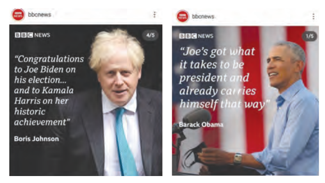
Pic. 2. BBC News [3]

On the 8<sup>th</sup> of November official page of BBC News in Instagram has posted informative memes (pic. 2) which represent the words of congratulation to the recently elected President of the USA Joe Biden.