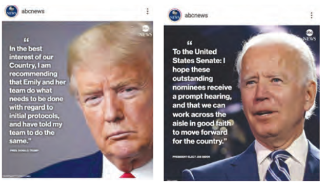
Pic. 7. ABC News [2]

ABC News forms all its Internet-memes following official style and chooses abstracts with neutral presentations of the politicians. But looking inside the communicative means of the speakers it is seen that Donald Trump more often uses the pronoun " I " while Joe Biden uses " we " stressing on the cooperation.